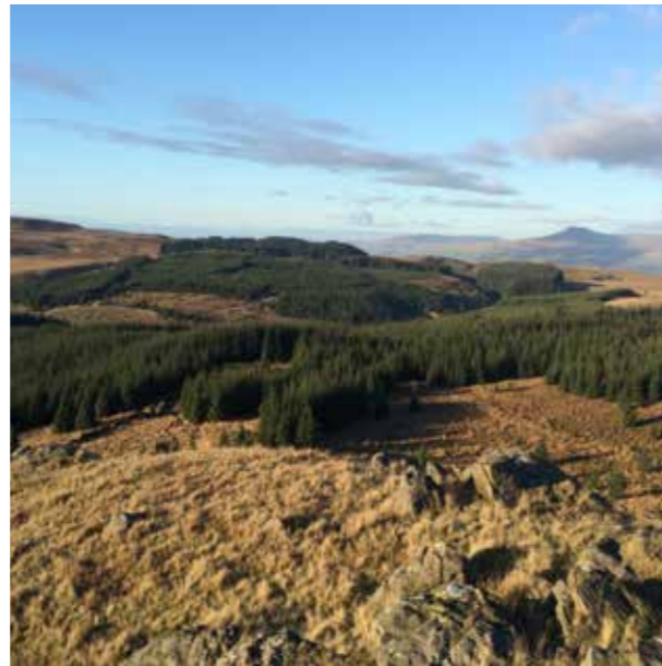
LONGRIDGE FELL, CROMWELLS BRIDGE, STONEYHURST COLLEGE, FORREST OF BOWLAND

Your Bikes will be fully charged and ready to roll on check-in, on day one we would recommend a circular cycle route taking in some attractive stopovers and popular visitor attractions.