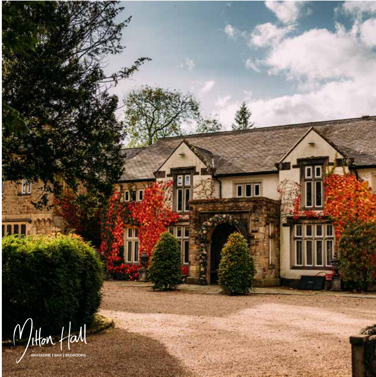
MITTON HALL, WHALLEY