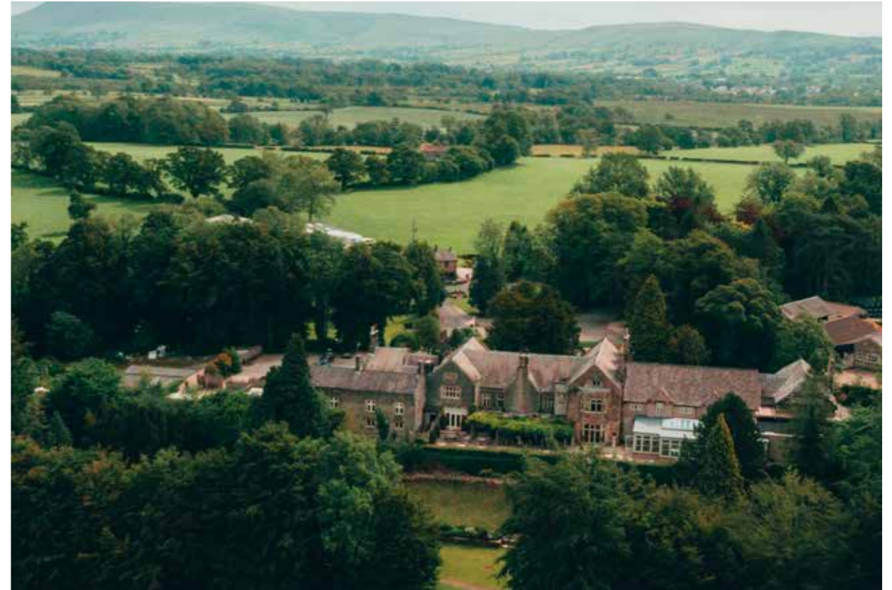
MITTON HALL, WHALLEY

We are an eclectic group of businesses in the Ribble Valley, Lune Valley and the Yorkshire Dales. Although no two are alike, what links them together is a passion for fabulous food, great service and a warm, friendly ambience that's apparent as soon as you walk through the door.