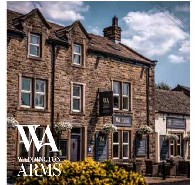
WADDINGTON ARMS, WADDINGTON

Whether it's a stunning country house hotel or 17th century inn, choose your accommodation and then let us help you create an itinerary which will have you exploring the quiet byways and back roads of this idyllic corner of Lancashire by e-bikes.