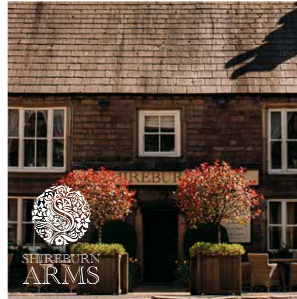
SHIREBURN ARMS, HURST GREEN