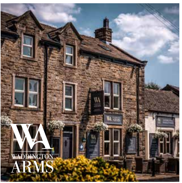
WADDINGTON ARMS, WADDINGTON

Whether it's a stunning country house hotel or 17th century inn, choose your accommodation and then let us help you create an itinerary which will have you exploring the quiet byways and back roads of this idyllic corner of Lancashire by e-bikes.