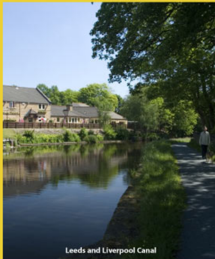
Leeds and Liverpool Canal

The last steam powered weaving mill in Britain, where the magnificent steam engine 'Peace' powers over 300 deafening Lancashire looms producing yards of cotton cloth for export. Interactive exhibits allow you to zoom into the looms for a closer look and you can hear all about 'life at t'mill' as former mill workers tell their stories. Tel. 01282 412555