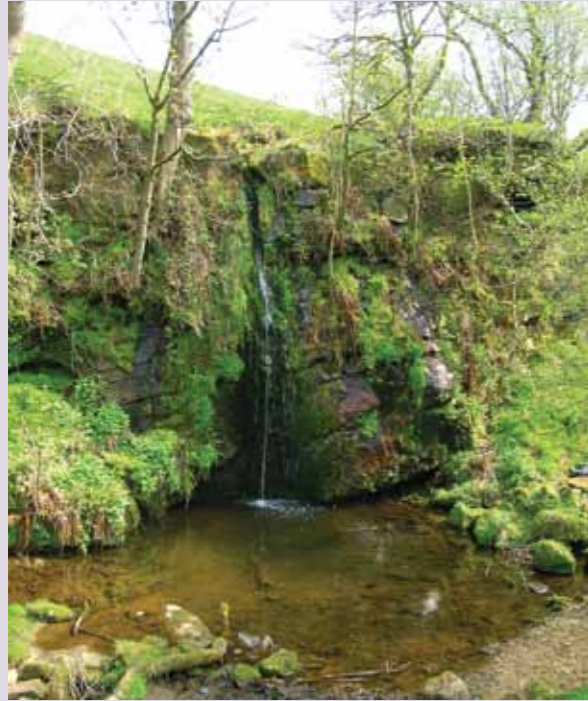
Lumb Spout Waterfall

of a nearby café and a bungalow are still clearly visible. The buildings had their electricity supply produced by a waterwheel.