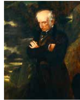
William Wordsworth (1770-1850)

We took the early part of the tide, and entered these vast and desolate plains before the sea had entirely left them, or the morning mists were sufficiently dissipated to allow a view of distant objects; but the grand sweep of the coast could be faintly traced, on the left, and a vast waste of sand stretching far below it, with mingled streaks of gray water, that heightened its dreary aspect. The tide was ebbing fast from our wheels, and its low murmur was interrupted, first, only by the shrill small cry of sea-gulls, unseen, whose hovering flight could be traced by the sound, near an island that began to dawn through the mist; and then, by the hoarser croaking of sea-geese, which took a wider range, for their shifting voices were heard from various quarters of the surrounding coast. The body of the sea, on the right, was still involved, and the distant mountains on our left, that crown the bay, were also viewless; but it was sublimely interesting to watch the heavy vapours beginning to move, then rolling in lengthening volumes over the scene, and, as they gradually dissipated, discovering through their veil the various objects they had concealed—fishermen with carts and nets stealing along the margin of the tide, little boats putting off from the shore, and, the view still enlarging as the vapours expanded, the main sea itself softening into the horizon, with here and there a dim sail moving in the hazy distance. The wide desolation of the sands, on the left,