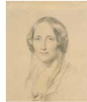
Elizabeth Gaskell (1810-1865)

was animated only by some horsemen riding remotely in groups towards Lancaster, along the winding edge of the water, and by a mussel-fisher in his cart trying to ford the channel we were approaching.