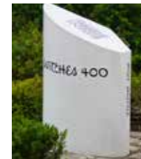
The 9th Tercet, Williamson Park

Outside the Williamson Park cafe also note the white cast-iron way marker featuring the 9th tercet from a poem by the Poet Laureate, Carol Ann Duffy, written to mark the 400 th anniversary of the execution of a group of men and women who became known as the Pendle Witches.