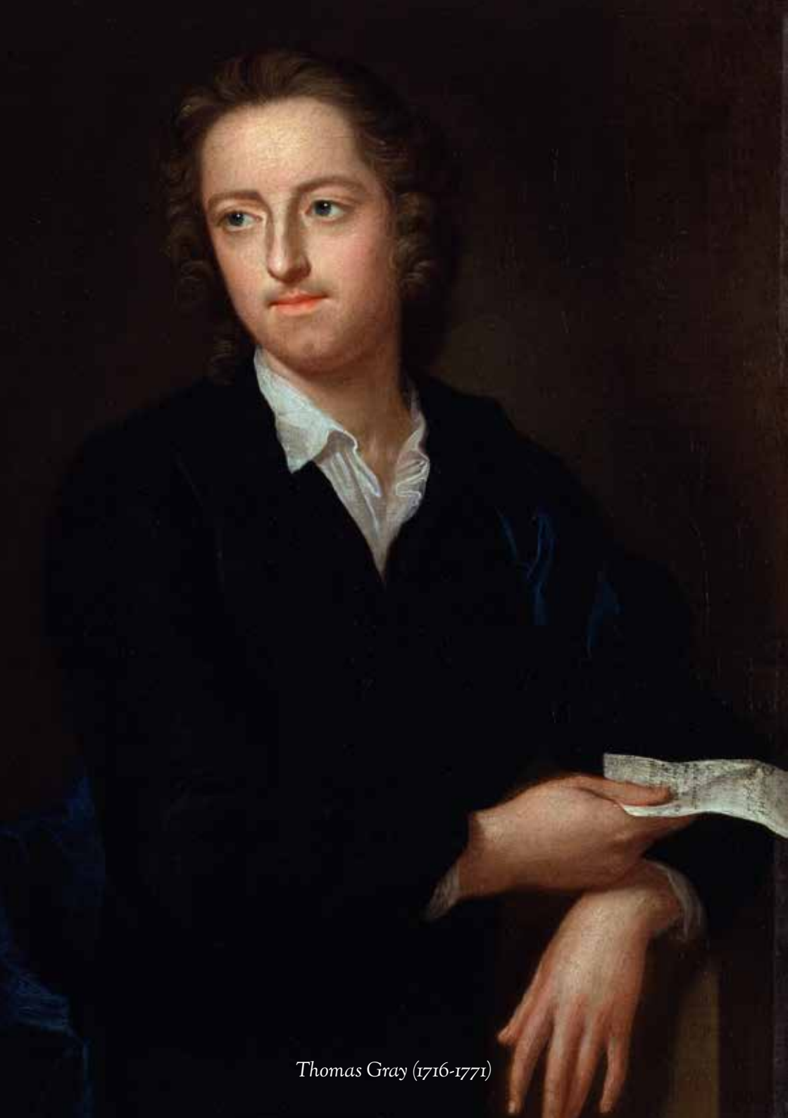
Thomas Gray (1716-1771)