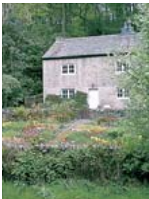
Sunnyhurst Visitor Centre