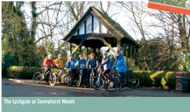
The Lychgate at Sunnyhurst Woods

Turn right out of the car park up the lane leading past Waterman's Cottage. At the fork keep left, climbing up the hill. Below to the right is Earnsdale Reservoir constructed in 1854 to supply Darwen water. Now sheltered by trees it provides a haven for waterfowl in the winter. Note also Sunnyhurst Wood nestling in the valley bottom and Darwen Golf Course on the hillside beyond.