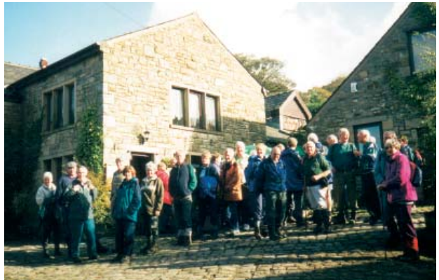
Ramblers at the Lychgate Hotel

The Kiosk serves drinks and snacks, is fully licensed and is also registered for marriage ceremonies. For opening times contact (01254) 701530.