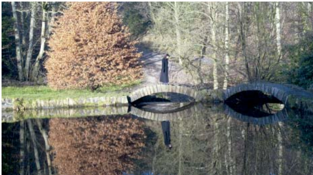
Sunnyhurst Woods Bridge.