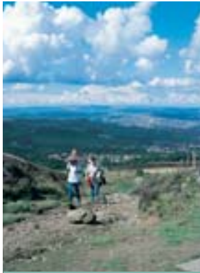
Family Walking on Darwen Moor

If walking early in the morning, look out for the occasional fox out hunting.