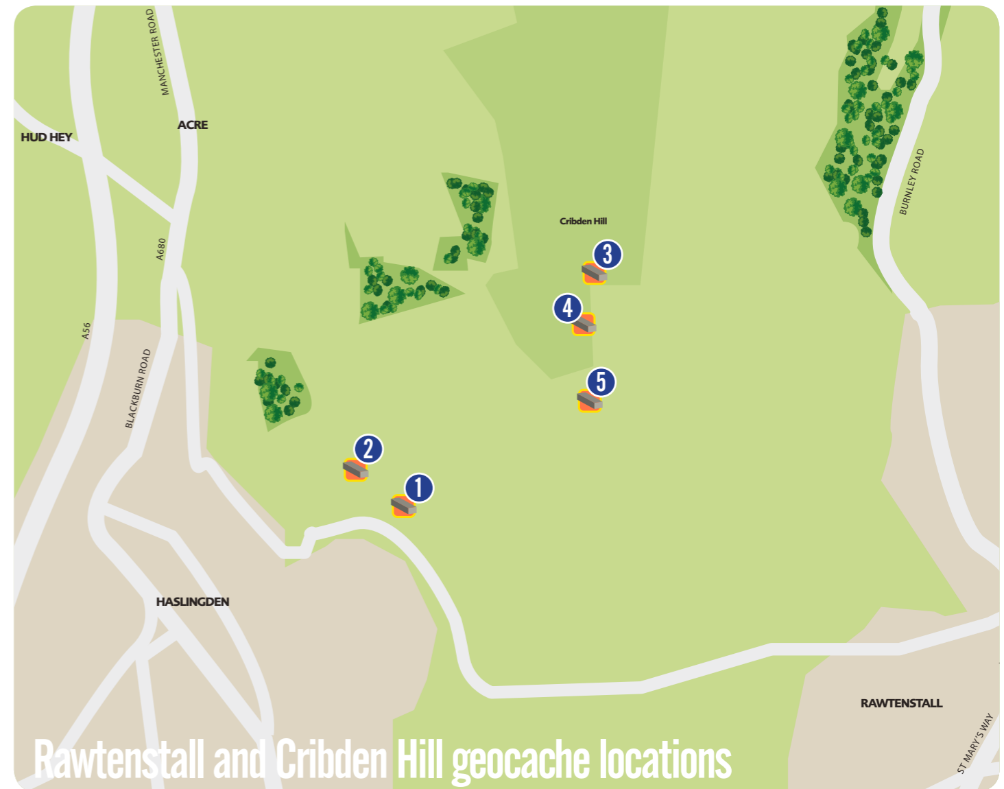
Rawtenstall and Cribden Hill geocache locations